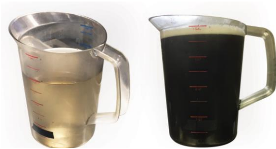
Generator water from SteamChef with KleanShield (left) and typical connectionless steamer (right) after cooking 3 pans of potatoes.