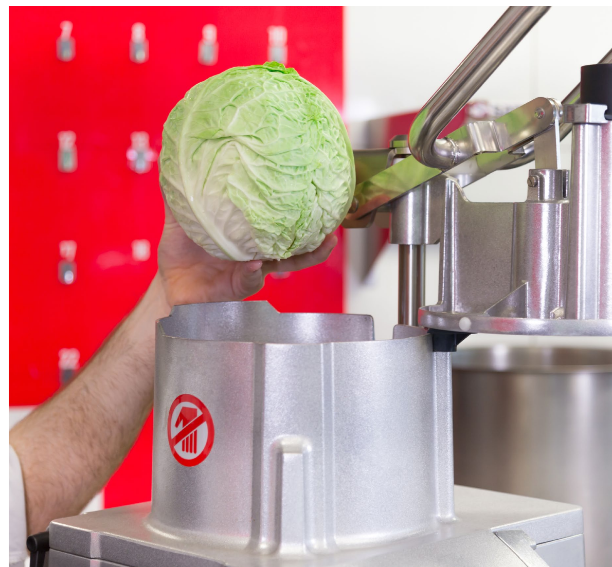
Large Capacity Attachment