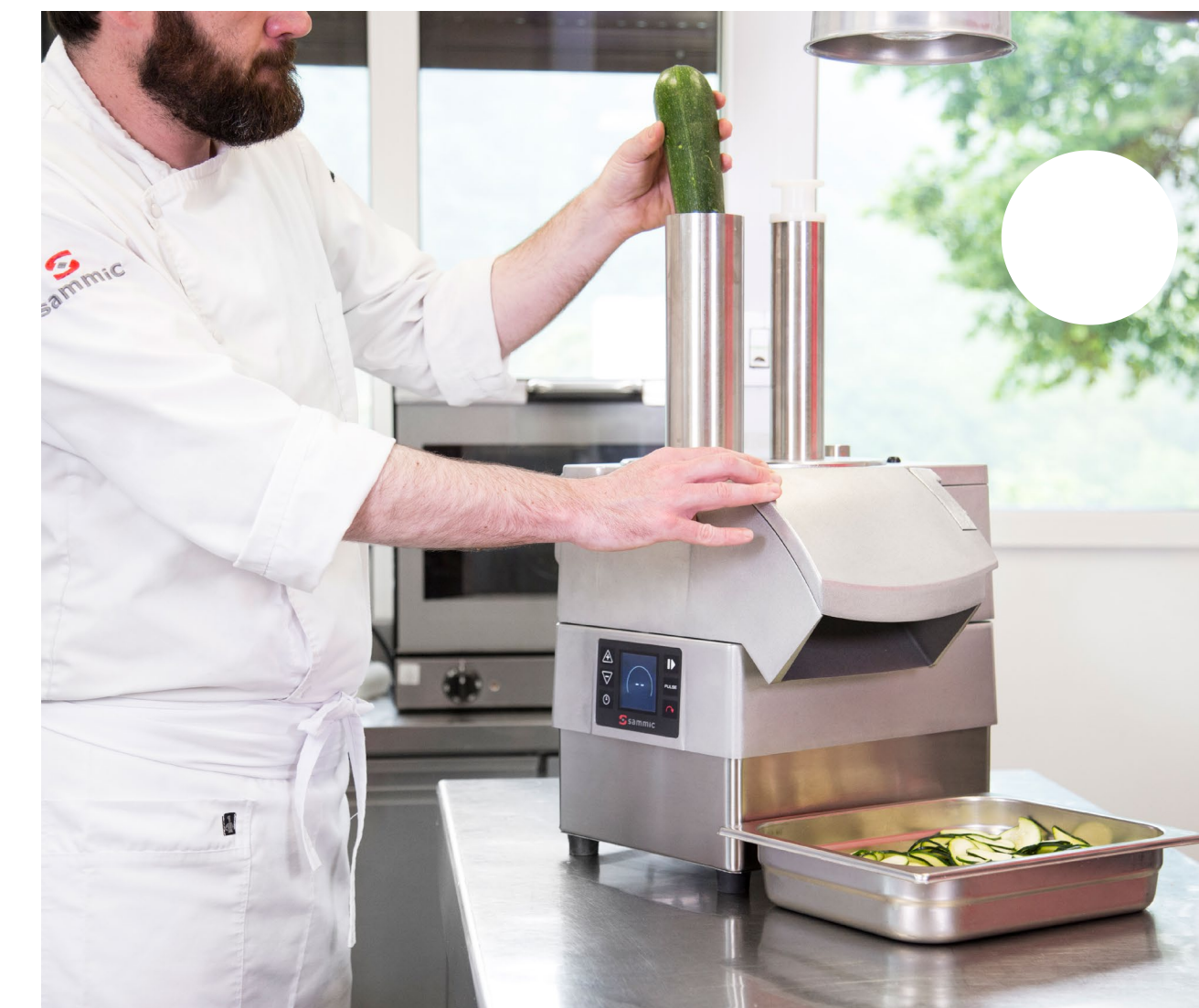
Long vegetable attachment