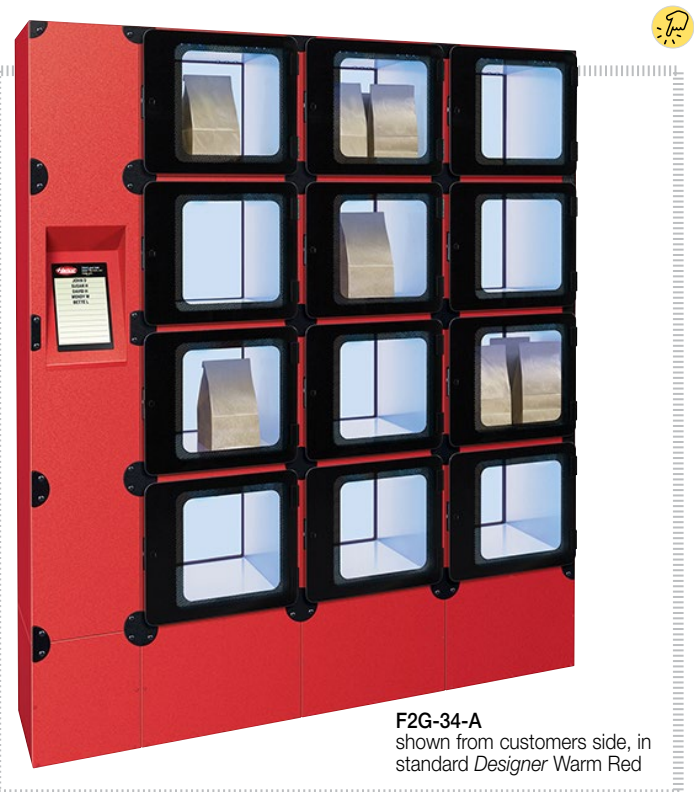
F2G-34-A shown from customer's side, in standard Designer Warm Red